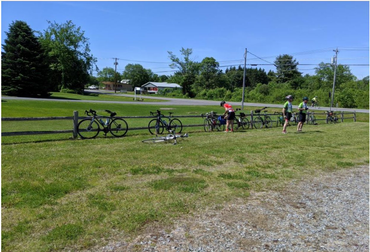
Tour de Cure—Galway Rest Stop