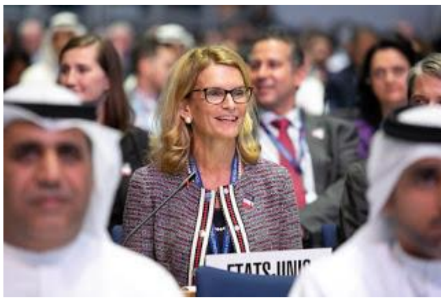
Doreen Bogdan-Martin, KD2JTX, Director of the ITU Telecommunication Development Bureau

Doreen Bogdan-Martin, KD2JTX, has been elected to head the International Telecommunication Union's (ITU's) Telecommunication Development Bureau. According to the ITU, Ms. Bogdan-Martin is the first woman elected to a top leadership position in the UN agency's 153-year history ( The ITU predates the United Nations - ed. ).