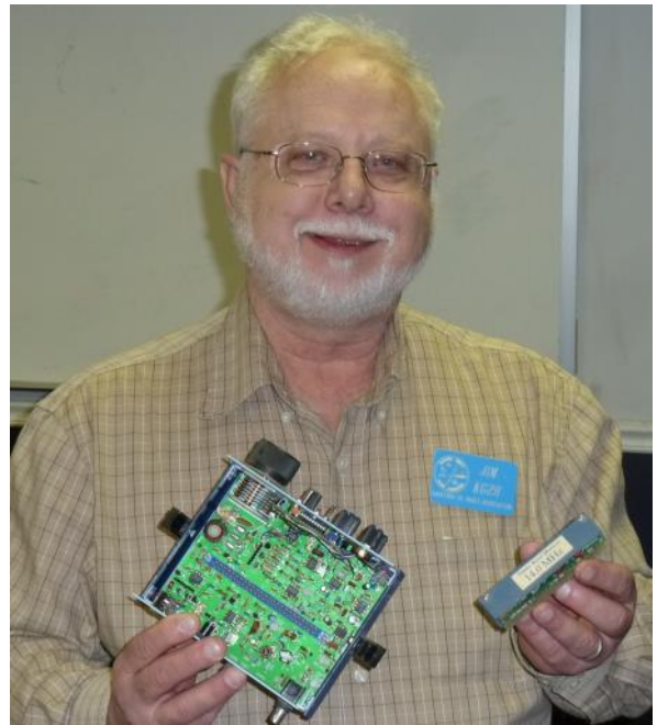
KG2H and QRP kit radio