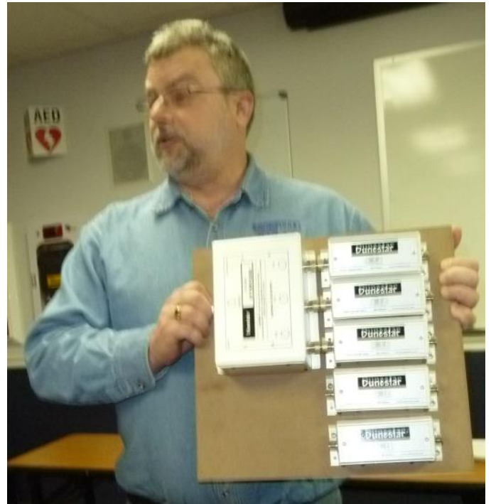
NJ1F shows off a nifty Triplexer