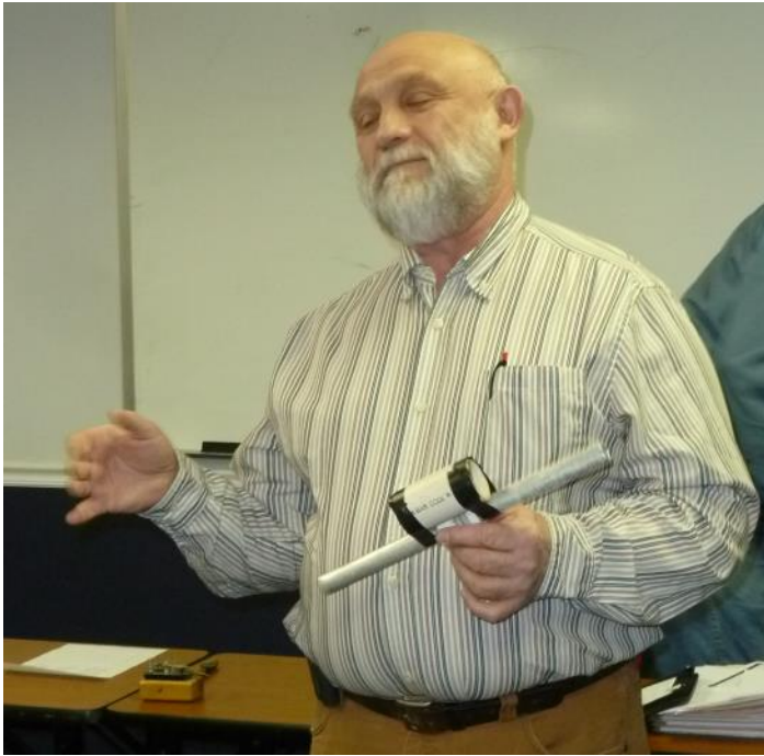
NR2T Tells us about his home brew 12 meter antenna