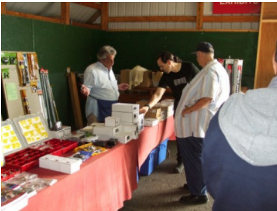
It really is a Radio Oasis!