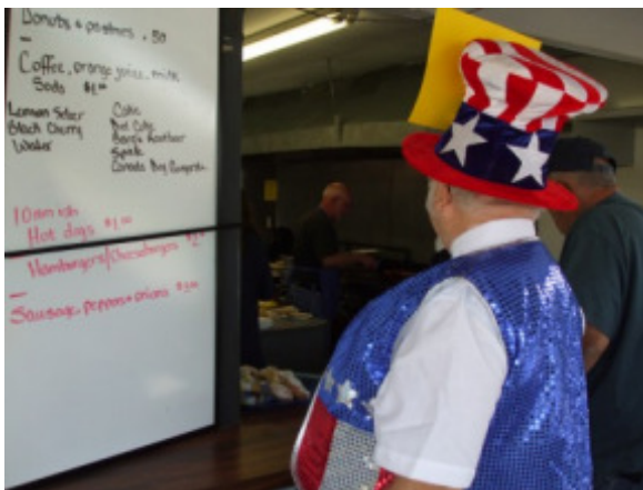
Uncle Sam makes a buying decision