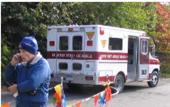
North East Mobile Search And Rescue Communications van and event personnel